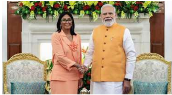
TRADE TALKS. Prime Minister Narendra Modi and acting President of Bolivarian Republic of Venezuela Delcy Rodríguez at Hyderabad House in New Delhi on Thursday

Modi said that India looked forward to building this relationship across both upstream and downstream activities. "Venezuela has already emerged as the third-largest crude oil supplier this month... There exists a per-