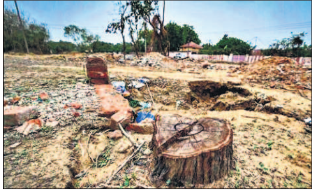
Remnants of trees on Chhattarpur Satbari-Gaushala road.

NEW DELHI: The Supreme Court on Wednesday held the Delhi Development Authority (DDA) in contempt for illegally felling over 1,000 trees in Delhi's Ridge area without its permission, calling the move a blatant breach of environmental norms and judicial orders. However, the court spared stringent action against top DDA officials, citing the "overwhelming public interest" served by a new road leading to a multi-specialty hospital for the Central Armed Police Forces (CAPF).