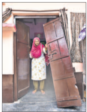
A woman shows a door, which she alleged was broken by police during a raid at her house in Ghaziabad.

GHAZIABAD: A week after a Noida police constable was shot dead during a raid in Ghaziabad's Nahal village, the arrest tally has risen to 14. But according to residents, at least 50 to 60 more men have been picked up or detained in sweeping midnight raids that have left the village nearly deserted and families on edge. Around 70% of the village residents vacated by Tuesday, but the situation of those staying behind remained tense, locals said, adding that the village has heavy police presence and their property has been damaged by police in late-night raids.