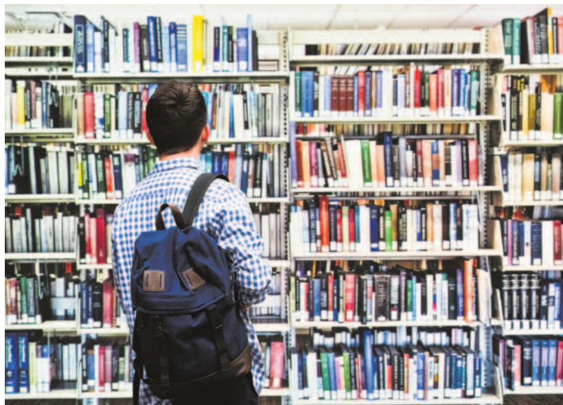
Last week, the Trump administration revoked Harvard's certification to admit foreign students in the 2025-26 academic year. A district court blocked the order.