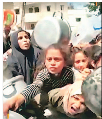
गाजा में भोजन के लिए लाइन में लगे फिलिस्तीनी

वीर अल बलाह, एजेंसी। गाजा के शहर में एक सहायता वितरण केंद्र पर भगदड़ में एक की मौत हुई थी।