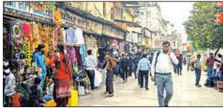
जलसाता सिंवादनता लाल किले, 12 नवंबर।

लाल किले के सामने हुए विस्फोट को तीन घंटे के बाद ही और अब आसपास के बाजारों में भी-भीरु जनजीवन पटरी पर लौटता दिखाई दे रहा है। दुकानों को खोलकर प्रधानमंत्री नरेंद्र मोदी के एलएनजेम अस्पताल वीर के वायु क्षेत्र की अधिकांश दुकानें खुल गईं। वहीं तो वीरों से बंद पड़ी दुकानों में अब व्यापारियों की मौजूदगी नजर आई, हालांकि शांति का आन-जाना बरकरार रहा।