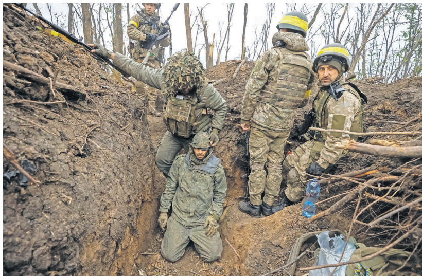
Moscow acknowledged on Friday that its forces had fallen back north of Bakhmut.

Russia's defence ministry said on Sunday that two of its military commanders were killed in eastern Ukraine, as Kyiv's forces renewed efforts to break through Russian defences in the embattled city of Bakhmut. In a daily briefing, the ministry said that Commander Vyacheslav Makarov of the 4th Motorized Rifle Brigade and deputy commander Yevgeny Brovko from a separate unit were killed trying to repel Ukrainian attacks.