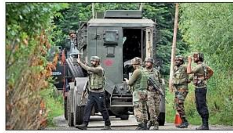
On Saturday, terrorists were sighted in Ahlan Gagarmandu forest of Anantnag. As soldiers approached the spot, the terrorists unleashed a barrage of gunfire, wounding six soldiers and two civilians

Srinagar/Jammu: The death count from Saturday's shootout between security forces and terrorists in the remote upper reaches of J&K's Anantnag district rose to three, with one of the two civilians caught in crossfire dying of gunshot wounds in the hospital on Sunday.