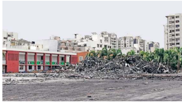
The ruins at the site of TRP Game Zone fire on Wednesday.