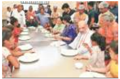
Union Minister Amit Shah at Annakshetra in Mansa on Sunday.