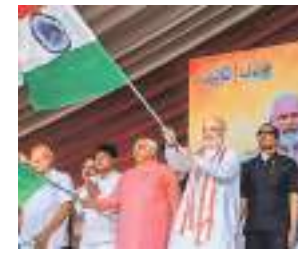
Amit Shah with Chief Minister Bhupendra Patel flags off Tiranga Yatra in Ahmedabad Sunday.

"Recently, they (opposition parties) brought a no-confidence motion. (Prime Minister Narendra) Modi saheb slammed them so much that they did not even listen to him. Under the UPA (United Progressive Alliance), led