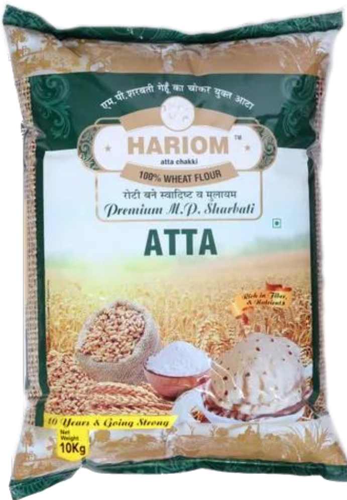
HARIOM SHARBATI ATTA