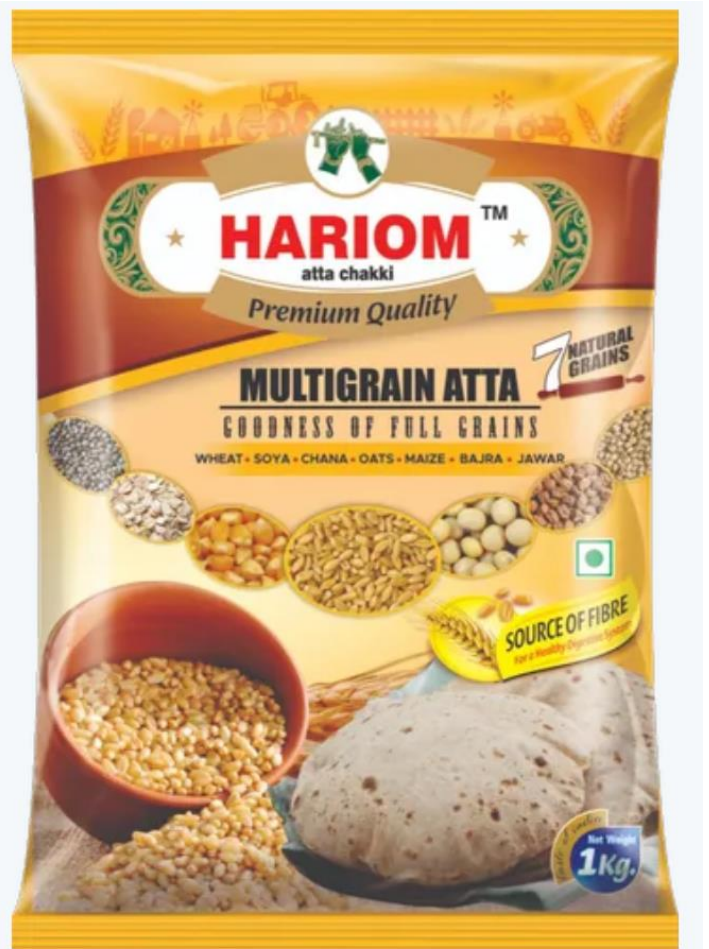
HARIOM MULTIGRAIN ATTA

Website: www.hariomatta.com , E-mail ID: info@attahariom.com , Contact No.: +91 9717838568 Registered office address: D-498, 1 st Floor, Palam Extension, Sector-7, Dwarka, New Delhi -110 077 India