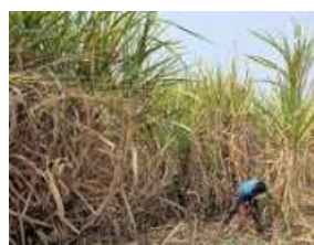
Production this year may be 400-420 mt, but poor rainfall could drag it to 390 mt.

EARLY INDICATIONS "Looking at this year's sugar balance sheet, even 20 mil-