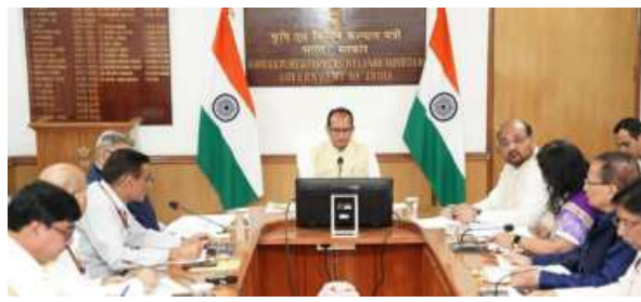
TAKING STOCK. Agriculture Minister Shivraj Singh Chouhan reviewed crop sowing progress with officials from the Agriculture Ministry, the ICAR, the Rural Development Ministry and the India Meteorological Department.

The Ministry has drawn up State-wise contingency plans recommending alternative crops suited to defi-