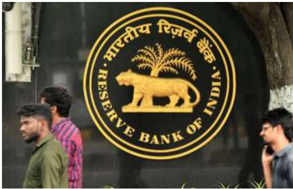
GROWTH FORECAST. Benchmarks tumbled as RBI revised its FY25 GDP growth forecast to 6.4% from 6.6%

"A rate cut aimed at reviving the slowing economy is a positive indicator. However, yields edged higher as investors were disappointed by the absence of anticipated liquidity measures, leading to profit-taking in the indices," said Vinod Nair, Head