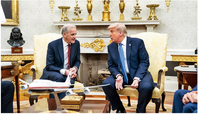
President Trump and Norway PM Stoltenberg at the White House in April 2025

Prime Minister Jonas Gahr Stoltenberg that was seen by Reuters, Trump said: “Considering your country decided not to give me the Nobel Peace Prize for having stopped 8 Wars PLUS, I no longer feel an obligation to think purely of Peace, although it will always be predominant, but can now think about what is good and proper for the United States of America.”