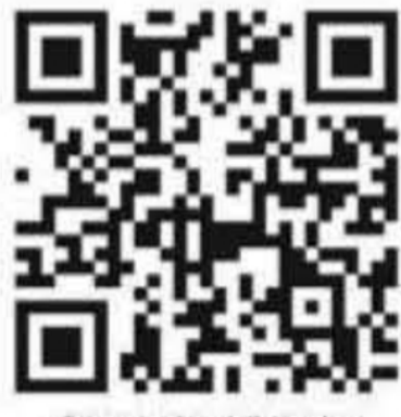
Scan to view full results

The full format of the audited Standalone and Consolidated Financial Results for the Fourth Quarter and Financial Year ended March 31, 2026 are available on the Stock Exchange websites www.nseindia.com and www.bseindia.com and company website https://www.olaelectric.com/investor-relations/financials and can be accessed by scanning the QR code.