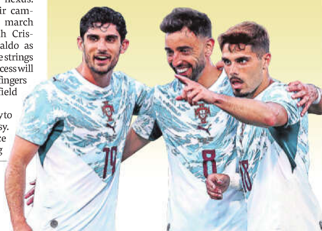
Bruno Fernandes (C) headlines Portugal's midfield at the World Cup