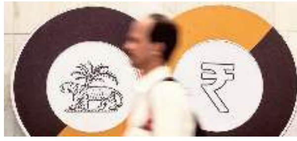
EXTENDED COVERAGE. RBI's directions are applicable to commercial banks, co-operative banks, NBFCs and All India Financial Institutions

The 20 impacted sectors hit by US' steep tariffs include fisheries, organic chemicals,