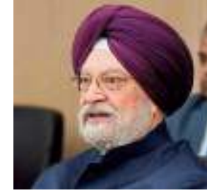
Hardeep Singh Puri, Petroleum Minister

India is seeking Korea's support to build oil tankers and LNG carriers as it looks to cut dependence on foreign flagged vessels.