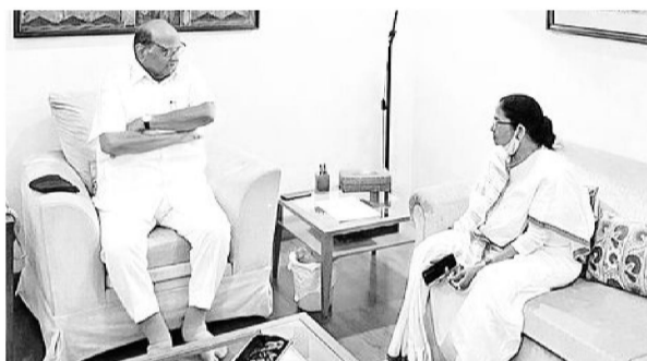
Trinamool Congress chief Mamata Banerjee called upon NCP chief Sharad Pawar at his residence in New Delhi

Interestingly, the information that Pawar has refused to be the joint Opposition candidate was conveyed to the public by CPI(M) General Secretary Sitaram Yechury. Pawar met Yechury, CPI gen-