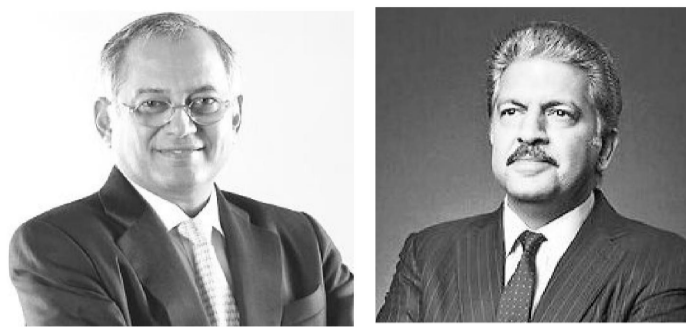
Members Venu Srinivasan (left) and Anand Mahindra