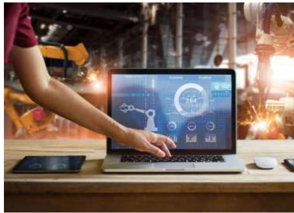
EXPLORING OPTIONS. India came up with the idea of a possible online platform for technology exchange to support global efforts to address the digital divide

NEW FRAMEWORK "The WTO has a unique opportunity to contribute towards addressing the digital divide in terms of digital in-