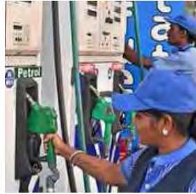
A late night cut in fuel prices is believed to have been reversed by morning

Oil marketing companies (OMCs) are believed to have retracted a decision to reduce the retail prices of petrol and diesel by 40 paise from Tuesday.