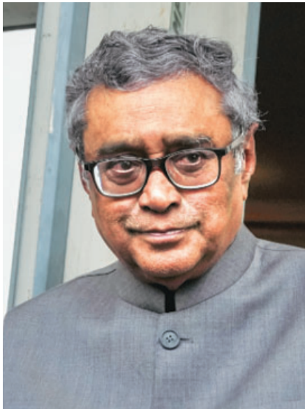
स्वप्न दासगुप्ता के पास वित्तीय और कंपनी क्षेत्र में काम करने का अच्छा अनुभव है

वर्ष पत्रकार स्वप्न दासगुप्ता पश्चिम बंगाल में वित्त मंत्रालय की कमान संभालेंगे। राज्य के मुख्यमंत्री शुभेंद्रु अधिकारी ने बुधवार को दासगुप्ता को वित्त मंत्रालय संभालने की जिम्मेदारी दी। तापस राय को उद्योग एवं वाणिज्य विभाग सौंपा गया है। कोलकाता की रासबिहारी विधान सभा सीट से निर्वाचित स्वप्न दासगुप्ता ने लंदन यूनिवर्सिटी के स्कूल ऑफ ऑरिएंटल ऐंड अफ्रीकन स्टडीज से इतिहास में डॉक्टरेट की डिग्री हासिल की है। वह वर्ष 2015 में यूनिट ट्रस्ट ऑफ इंडिया (सूटी) के प्रशासक के नामित व्यक्ति (नॉमिनी) के तौर पर लार्सन एंड टुब्रो के निदेशक मंडल (बोर्ड ऑफ डायरेक्टर्स) में शामिल हुए थे। मगर वर्ष 2016 में राज्य सभा का सदस्य बनने के बाद उन्होंने यह पद छोड़ दिया।