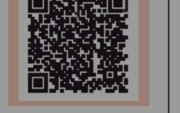
Issued in public interest by VFS Global

To report any suspected fraudulent activity, applicants/travellers can scan this QR code.