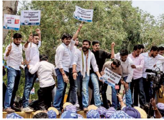
NTA members protest against the National Testing Agency over the cancellation of NEET (UG) 2026 exam, outside Shastri Bhawan in New Delhi on Tuesday.

The National Testing Agency (NTA) on Tuesday cancelled the National Eligibility cum Entrance Test (Undergraduate) 2026, or NEET (UG), examination conducted on May 3 amid allegations of a question paper leak, with the Centre ordering a comprehensive probe led by the Central Bureau of Investigation (CBI). The NTA said fresh examination dates would be announced separately, triggering protests from students.