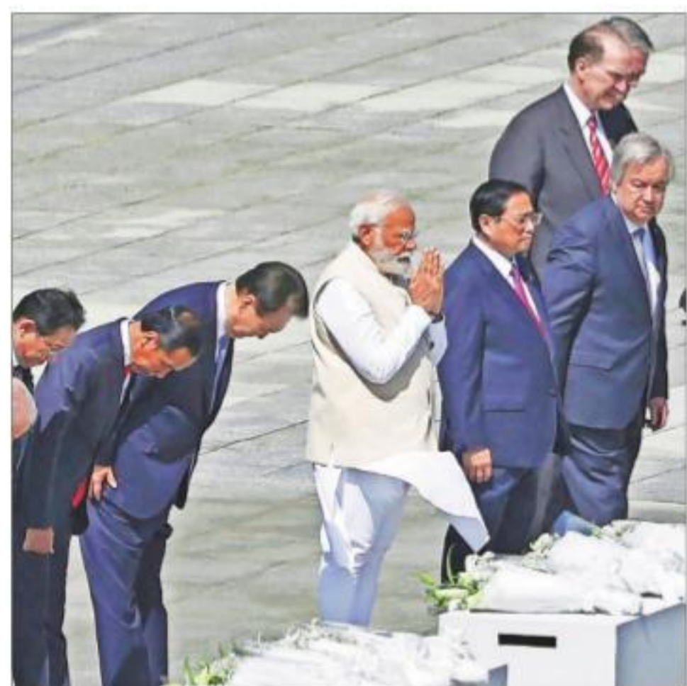
PM Narendra Modi pays homage at the Hiroshima Peace Memorial Museum in Japan on Sunday.

He flagged the impact of the war on food and energy security and ineffectiveness of the UN. "It is necessary that all countries respect the UN charter, international law and sovereignty and territorial integrity of all countries. Raise your voice together against unilateral attempts to change the status quo. India has