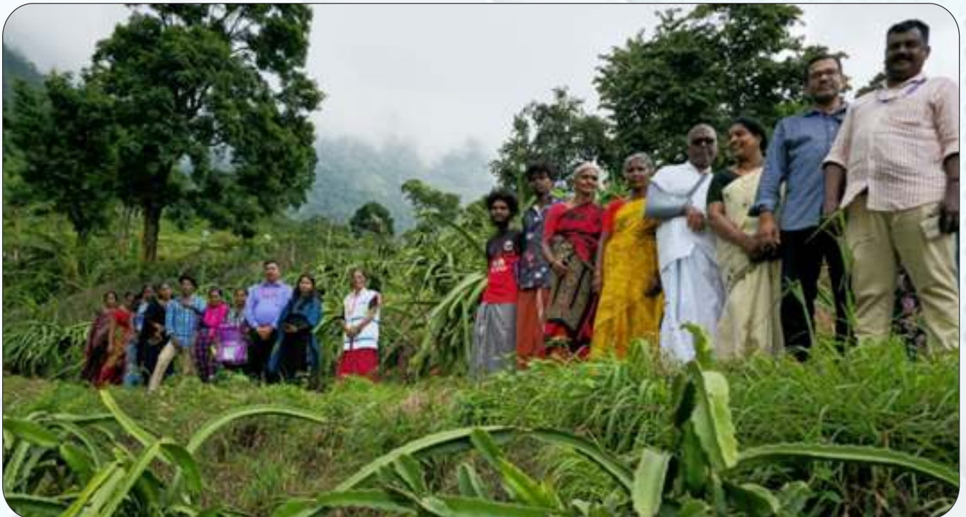
Promotion of Organic Fertilizers, Phosphate rich Organic Manures (PROM) and Potash derived from Molasses (PDM) under PM - PRANAM initiative of Government of India. Farmers meeting conducted in Dragon Fruit field in tribal Village Agali in Palakkad district (Kerala).