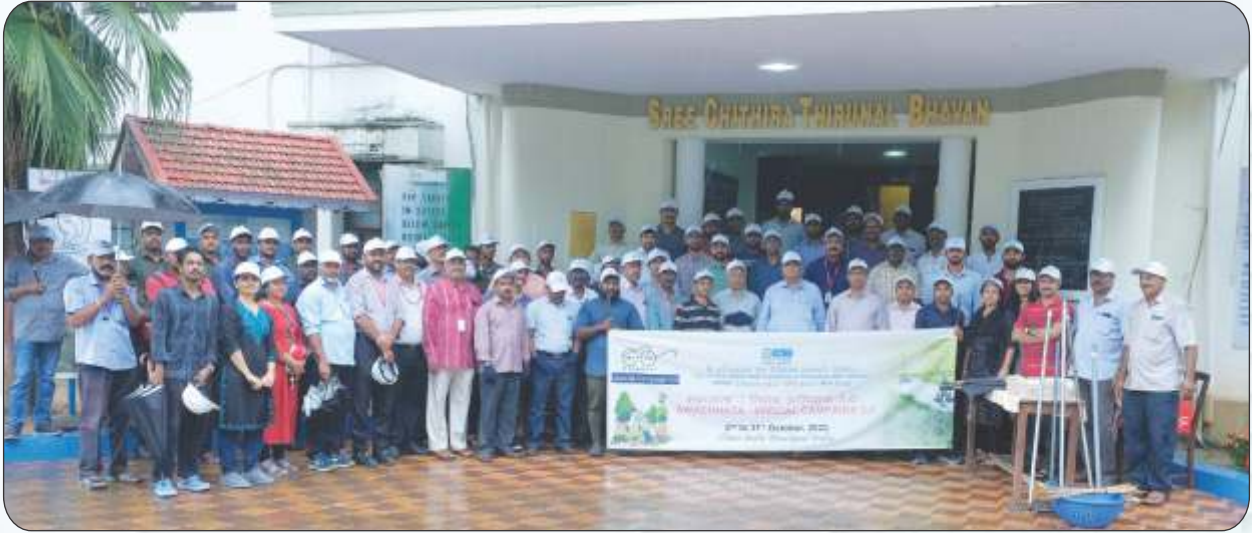
Cleanliness Drive held aty FACT in connection with Swachatha Special Campign 3.0