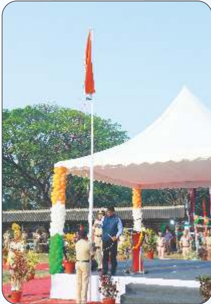
Former CMD Shri. Kishor Rungta unfurling the National Flag at the Republic Day Celebrations