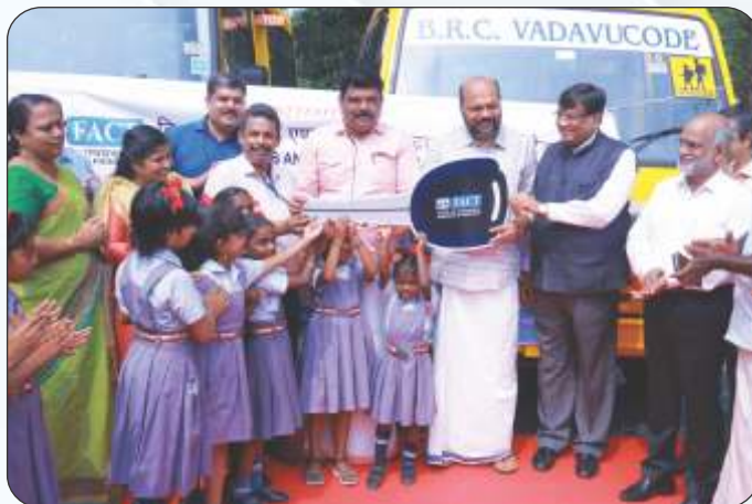
CSR - School Bus for BUDS School, Vadavucode