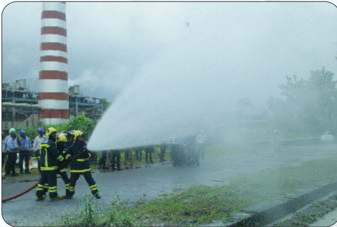
A view of Mock Drill

FACT & Oil India limited signed a MoU to explore green hydrogen, decarbonisation & clear energy initiatives, paving the way for a sustainable future.