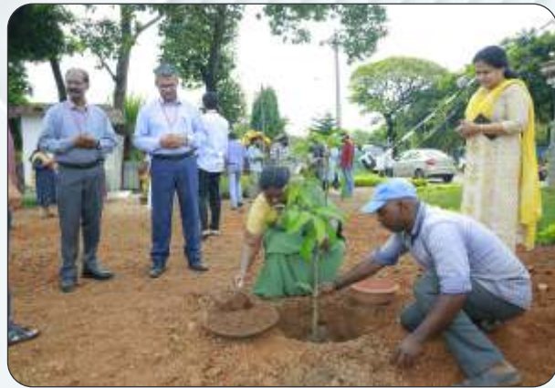
Ms. Soorya Thankappan, IPS planting a sapling at FACT Township in connection with the World Environment Day Celebrations