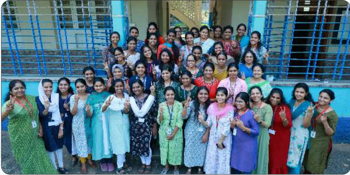
Women's Day Celebrations held at FACT