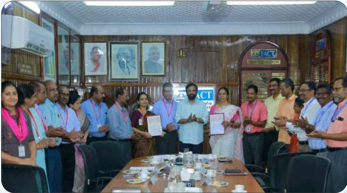
FACT & CUSAT signed MOU to institute the "FACT Chair Professor" in the Dept. of Safety & Fire Engineering, CUSAT