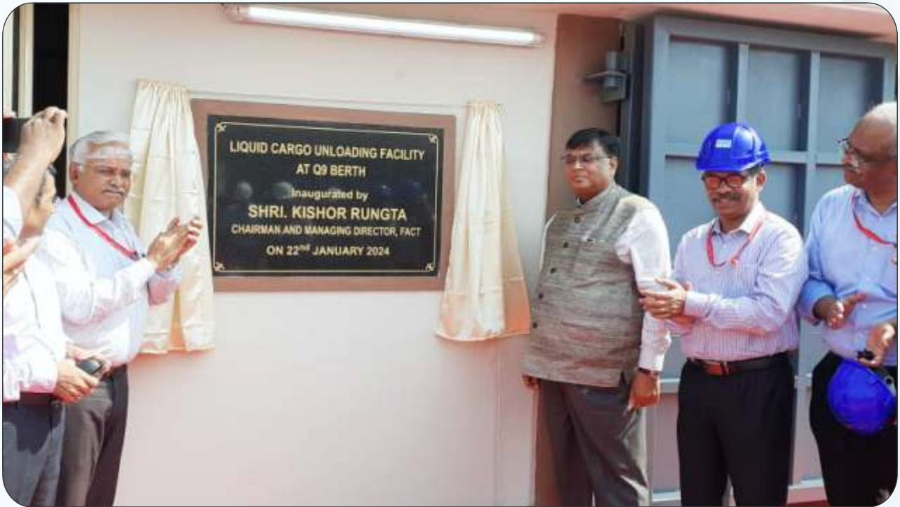
Inauguration of the Liquid Cargo Unloading Facility at Q9, Cochin Port