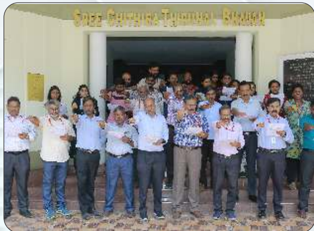
Pledge on the Occasion of Productivity week celebrations