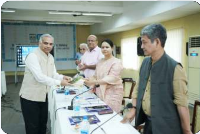
Visit of Secretary, National Commission for Scheduled Tribes (ST) to FACT on 29.02.2024