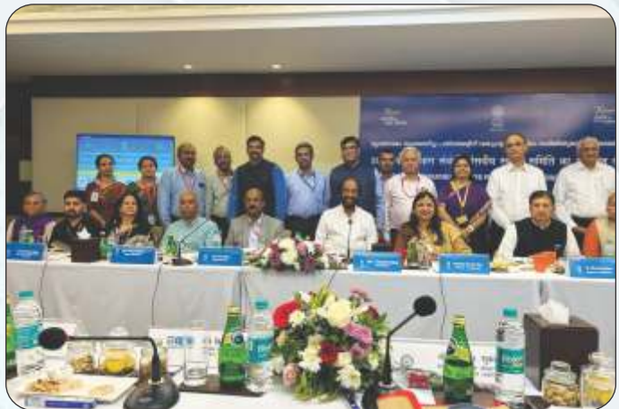
FACT's Meeting with the Department Related Parliament Standing Committee on Industry on 27.1.2024 at Kochi