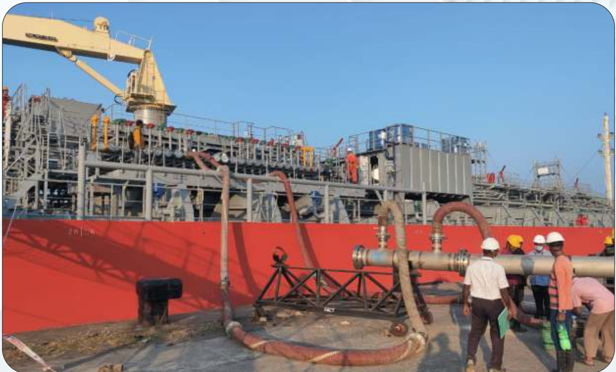
First 'Phosphoric Acid Ship' unloading from Q9 berth