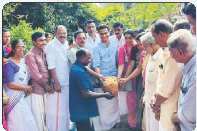
CSR- Foundation Stone laying of Smart Anganwadi at Karumalloor