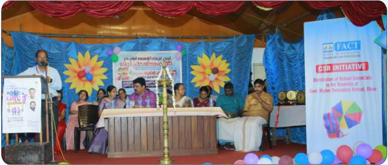
FACT distributed school essentials to the students of GHSS, Pathalam as part of its CSR initiative.