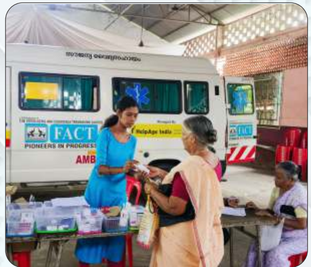
Mobile Health Unit