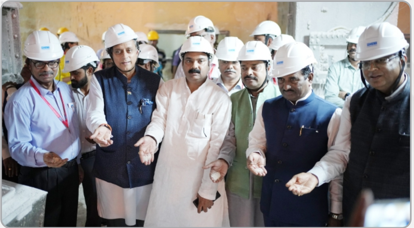
The Parliament Standing Committee on Chemicals and Fertilizers visiting FACT Fertilizer plants and railway sidings at FACT Cochin Division