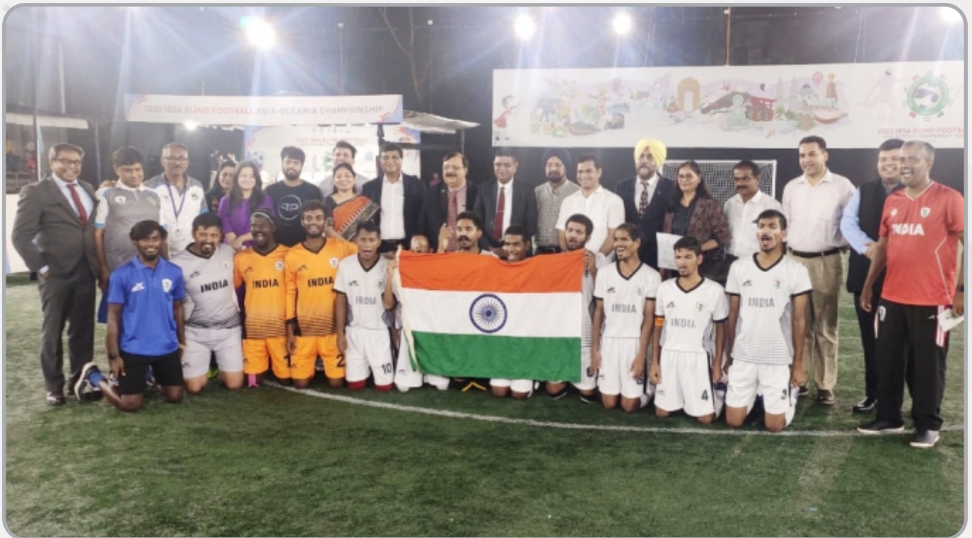
Shri Kishor Rungta, CMD, with the officials of Asian Blind Football Championship organized by Paralympic Committee of India