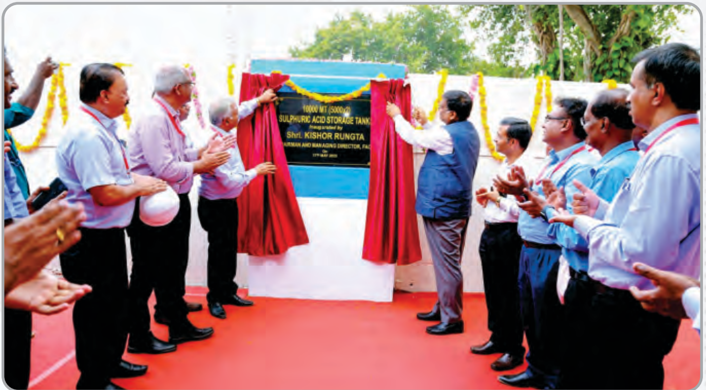
Shri Kishor Rungta, CMD, inaugurating new Sulphuric Acid Plant in FACT Cochin Division