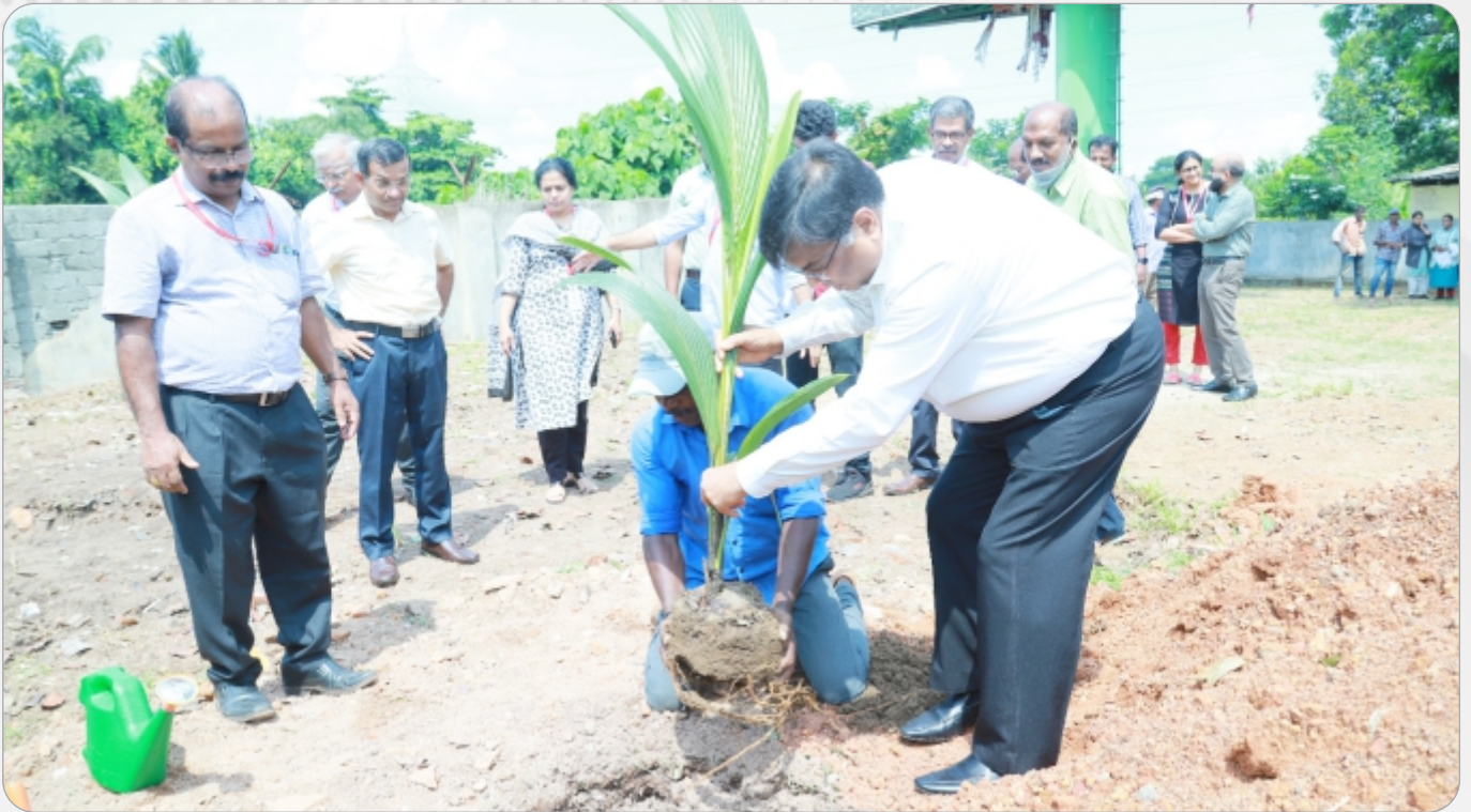
Shri Kishor Rungta, CMD, planting a sapling at FACT Township in connection with the World Environment Day Celebrations 2023.