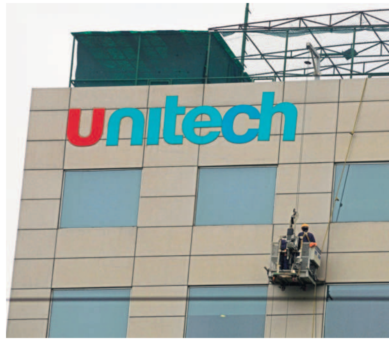
Nearly 15,000 units across 10 stalled Unitech projects in Noida and Greater Noida are pending despite homebuyers paying substantial sums years ago.

The order comes amid mounting concerns over funding shortages for completion of stalled Unitech housing projects across Noida and Greater Noida, where nearly 15,000 residential units across 10 projects are pending