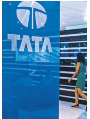
Iveco's acquisition is expected to close in Q2.

The deal requires the European Central Bank's go-ahead because Iveco has a non-banking financial company as well. Tata Motors did not immediately respond to Mint's emailed queries about the implications of the delay in