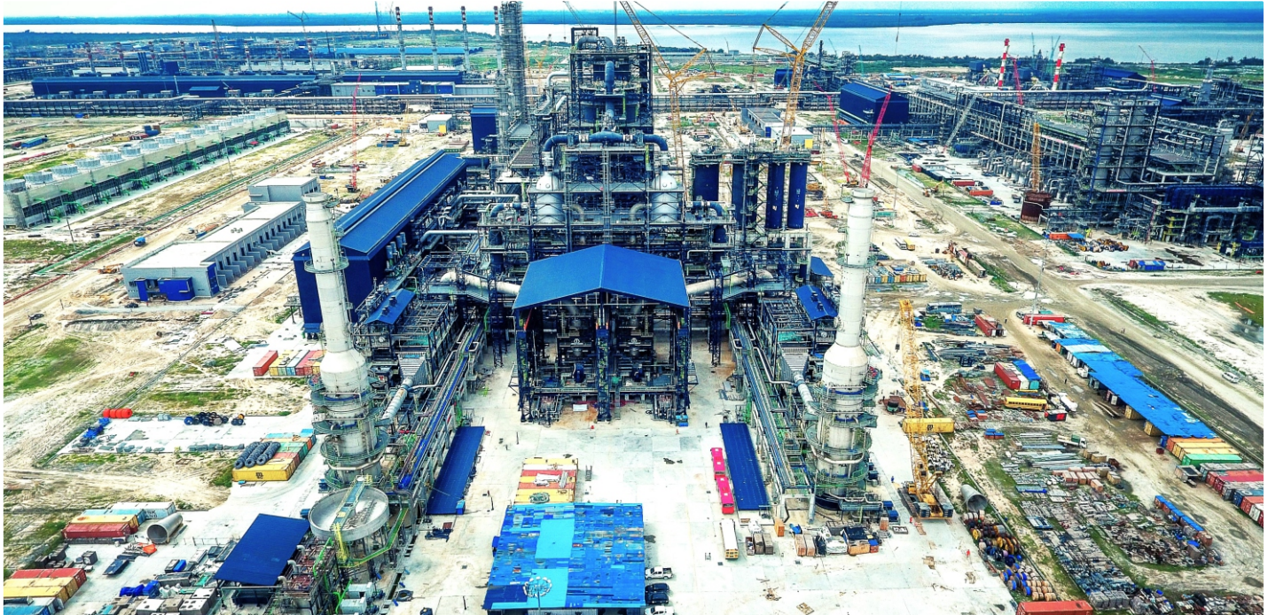
Dangote Refinery Project, Nigeria

Our social purpose, too, transcends compliance. Our initiatives included extending critical support to healthcare needs in Khunti and Koraput districts and supporting the Jan Arogyam Community Healthcare Programme in Ghaziabad. In doing so, we are not just investing in resources but also nurturing hope and equity.