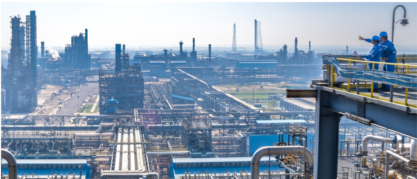
Guru Gobind Singh Refinery, Bhatinda, Punjab

Your company added another first to its credentials with the successful commissioning of the LPG Cavern Project of HPCL at Mangalore. This prestigious project has once again proven the technical and project management prowess of EIL in the niche segment of underground storage.