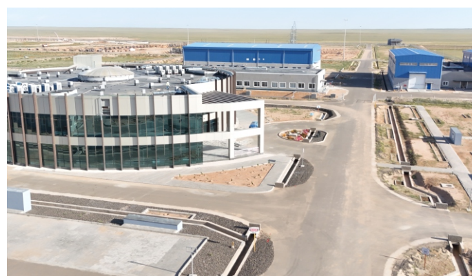
Crude Oil Refinery Project, Mongolia

Your company also procured goods and services worth ₹350.73 Crores from MSEs, pertaining to LSTK/OBE and in-house projects, reflecting the organization's commitment to supplement the Government of India's efforts for the development of MSEs.