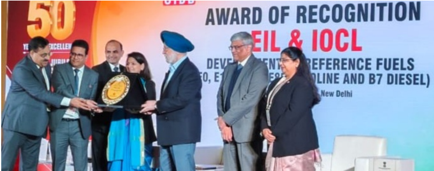
EIL & IOCL Teams conferred with OADB Award for the Development of Reference fuels

business segments, scale up in new energy sectors, expanding business in new geographies going local to global, exploring new avenues in high end infrastructure sector, sharpen technological edge, enhance localization, maintain sustainability as integral to strategy, develop a leadership pipeline and uphold the highest standards of governance and ethics.