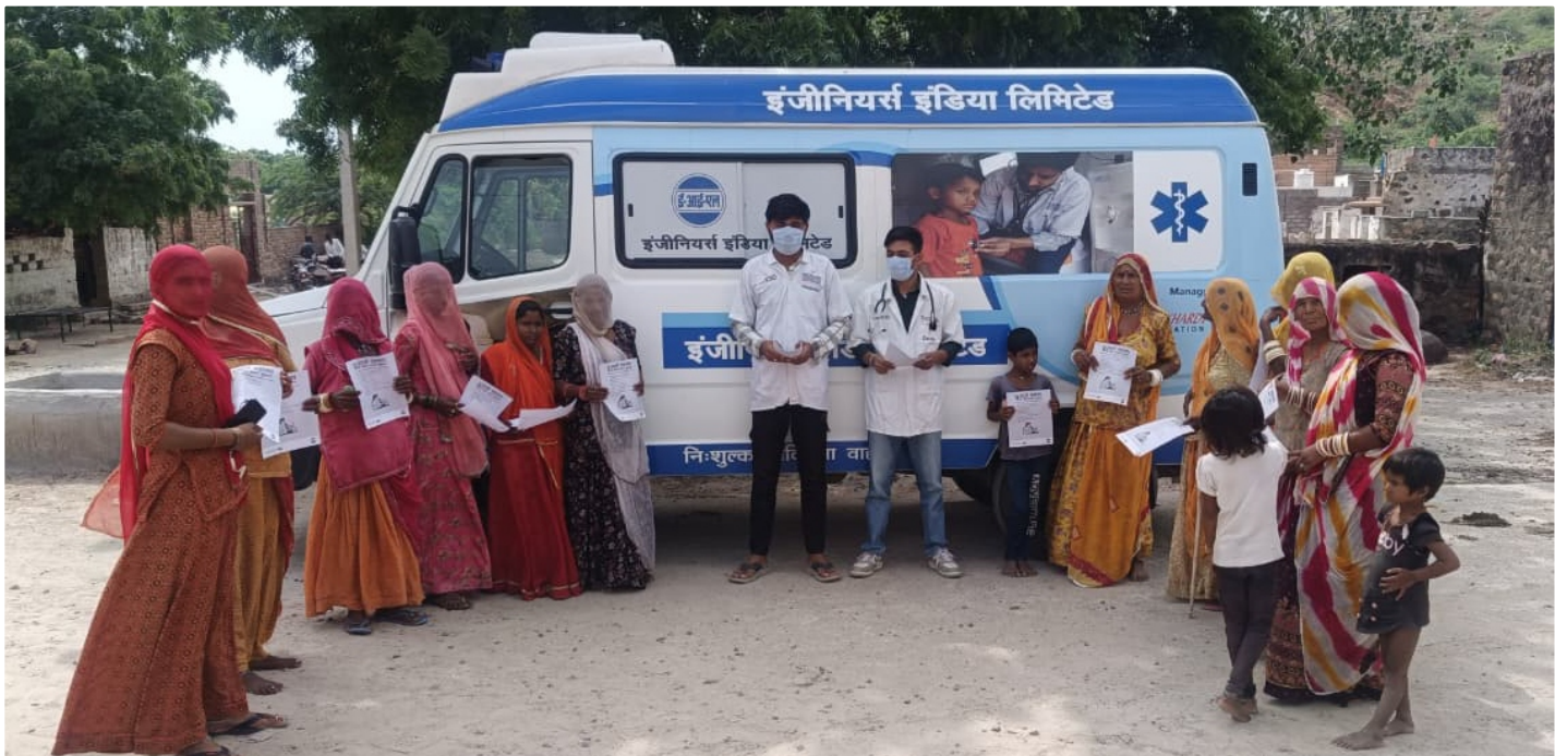
Medical Van for extending primary healthcare services to underprivileged people in rural areas around Barmer, Rajasthan

Going forward, your company shall continue to deliver excellence through its committed workforce, reinforcing leadership in its core