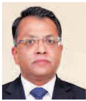
"I DON'T FORESEE THIS AS A LONG-TERM SETBACK. THE OPPORTUNITIES IN WEST ASIA ARE SO LARGE"

As part of the initiative, RITES developed India's first virtual trade corridor with the UAE. A significant recent development was operational-