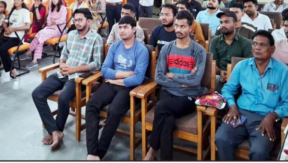
સરકારી જિલ્લા પુસ્તકાલય હિંમતનગરમાં યુવા સશક્તિકરણ દિવસ ઉજવાયો હતો.

મંત્રી અને અંબાજીમાં "હર ધર સ્વદેશી" ધર સ્વદેશી" અભિયાન અંતર્ગત અંબાજી ઓફિસમાંથી ભરૂચ કાર્થમ બ્રાન્ચે અંકલેશ્વર શેરબજારના ડબ્બા ટ્રેડિંગ તેમજ જુગાર રમતા પાંચ શપ્સોને રૂ.૩૦ લાખના મુદ્દામાલ સાથે ઝડપી પાડવા હતા.