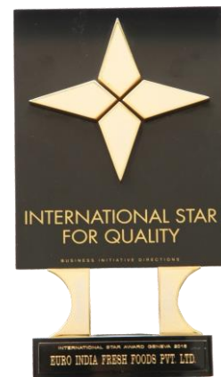
INTERNATIONAL STAR FOR QUALITY AWARD - GENEVA - 2015