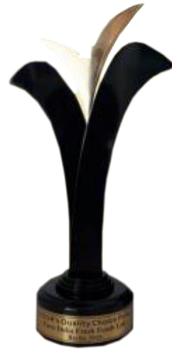
ESQR'S QUALITY CHOIC PRIZE - 2016