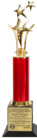
FASTEST GROWING INDIA COMPANY EXCELLENCE AWARD - 2015