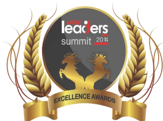
ASIS'S FASTEST GROWING MARKETING BRANDS, WCRC-204