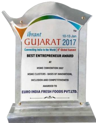
VIBRANT GUJRAT 2017 BEST ENTREPRENEUR AWARD