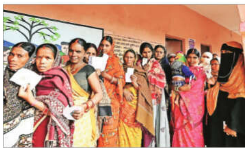
An outsized section of punditry attributes the NDA victory to the election-eve transfer of ₹10,000/- to women under the Mahila Rojgar Yojana, a first instalment in a scheme that aims to promote female entrepreneurship

The women's vote, fulsome as it may be, is not enough to explain the scale of the JD(U)-BJP victory. It doesn't tell the full story of why Nitish Kumar, chief minister almost without pause since 2005, and prolific switcher of political sides, swam more into focus in this