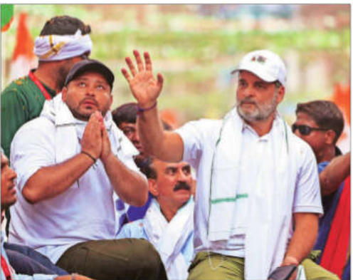
The opposition's campaign against the Special Intensive Revision of electoral rolls and the "vote chori" narrative also found no resonance with voters

If the RJD had risen from 22 seats in 2010 to 80 in 2015, it was because of its formidable social combination with the JD(U), with the Congress acting as the glue. In 2020, the RJD was the single-largest party because the Chirag Paswan-led Lok Janshakti Party (LJP), then undivided, contested the election on its own and ended up