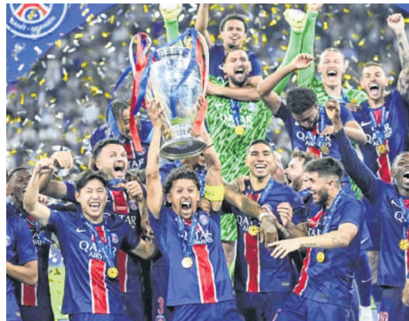
PSG players celebrate with the trophy after winning the Champions League in Munich on May 31, 2025.

"It's always difficult," said PSG president Nasser Al-Khelaifi, whose team stumbled to 15th place in the single-standings league last season before surging to its first Champions League title.