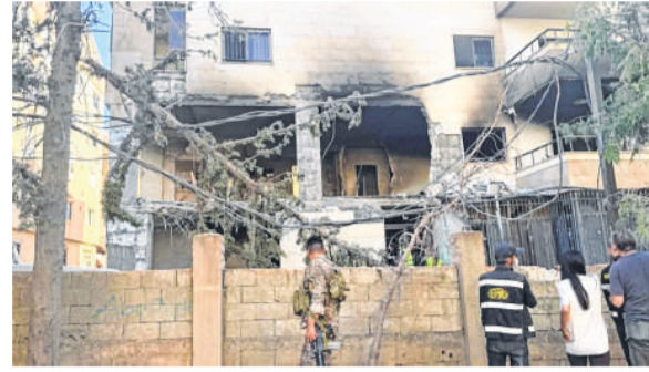
Beirut had until now been spared the intermittent attacks which have occurred despite a ceasefire

Lebanon's state-run National News Agency reported two waves of strikes in Tyre and nearby areas early Thursday.