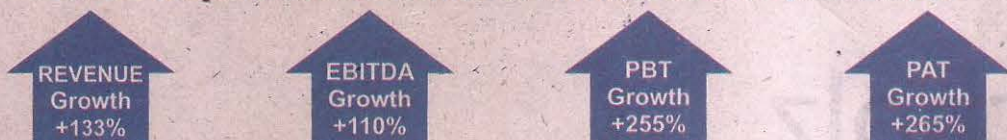
Figure above depicts consolidated result Q2, FY24-25 in comparison with Q2, FY23-24

Extract of Unaudited Financial Results for the Quarter & Half Year Ended September 30, 2024