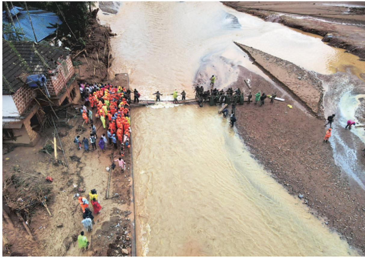
A drone view shows members of rescue teams crossing a temporary bridge to reach a landslide site in Kerala's Wayanad district on Wednesday. A series of landslides had hit the district following heavy rains on Tuesday