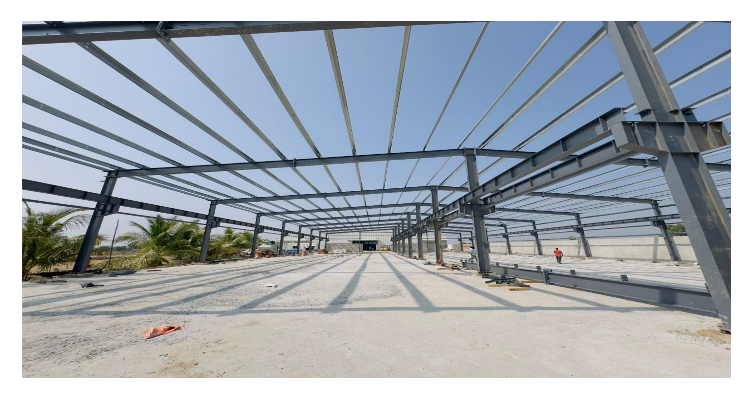
Shed No. 4 and 5 is under construction.