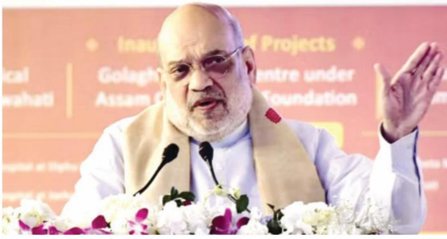
गृह मंत्रालय के अनुसार, सीमावर्ती ही नहीं, शहरी, औद्योगिक, आदिवासी क्षेत्रों में भी घुसपैठ की समस्या

भाजपा शासित अरुणाचल प्रदेश में मुख्यमंत्री पेमा खांडू ने शुक्रवार को कहा कि राज्य सरकार ने अनुसूचित जनजाति प्रमाण पत्रों के पुनर्सत्यापन, आंतरिक रेखा