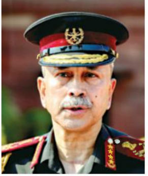
जनरल सुब्रमणि ने भारत के नए सीडीएस का पदभार संभाला

पाकिस्तान और चीन संबंधी मामलों के विशेषज्ञ माने जाने वाले जनरल सुब्रमणि ने रविवार को पदभार संभाल लिया। उन्होंने जनरल अनिल चौहान का स्थान लिया है, जिन्होंने शनिवार को ही देश के वरिष्ठतम सैन्य कमांडर के रूप में अपना कार्यकाल पूरा किया। जनरल सुब्रमणि इससे पहले राष्ट्रीय सुरक्षा परिषद सचिवालय (एनएससीएस) में सैन्य सलाहकार के रूप में कार्यरत थे। वह पिछले वर्ष