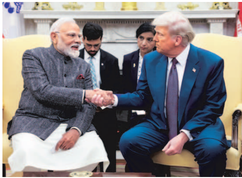
Prime Minister Narendra Modi met US President Donald Trump on February 13 during his visit to US