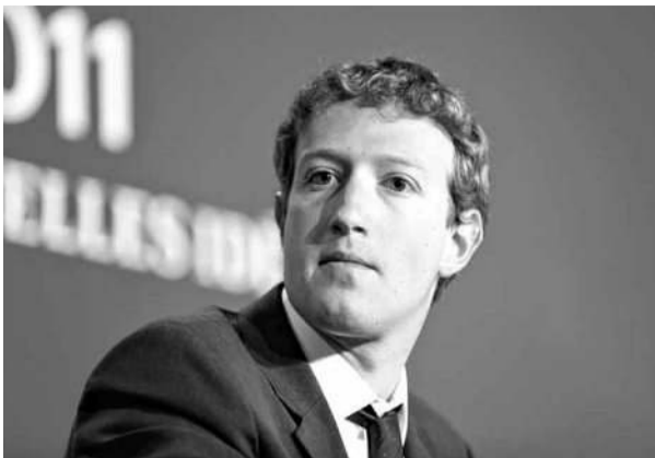
Meta insiders called Mark Zuckerberg’s push towards the prediction markets app as experimental, but top priority

For years, Zuckerberg has chased growth by looking for how user behaviour on the internet is changing and then quickly following fast-growing competitors such as Snap and others by cloning their apps and features. Those efforts have had mixed success. Meta has struggled with new standalone apps before, largely because it has been difficult to get people to find and download them. In 2019, under a team called “New Product Experimentation,” employees tried creating various social apps, including those focused on podcasts and travel, as well as music and matchmaking. Few