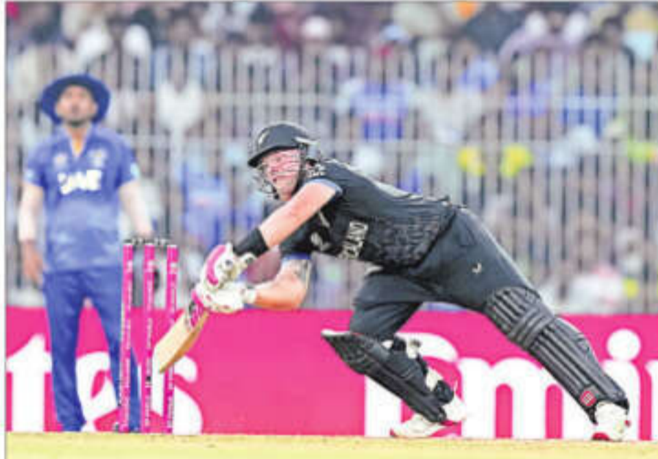
New Zealand's Tim Seifert during a T20 World Cup match against the United Arab Emirates in Chennai on Tuesday. New Zealand, the Netherlands & Pakistan won their group matches during the day

"The biggest growth has been seen from fans outside the full member countries. Nepal, who pushed England