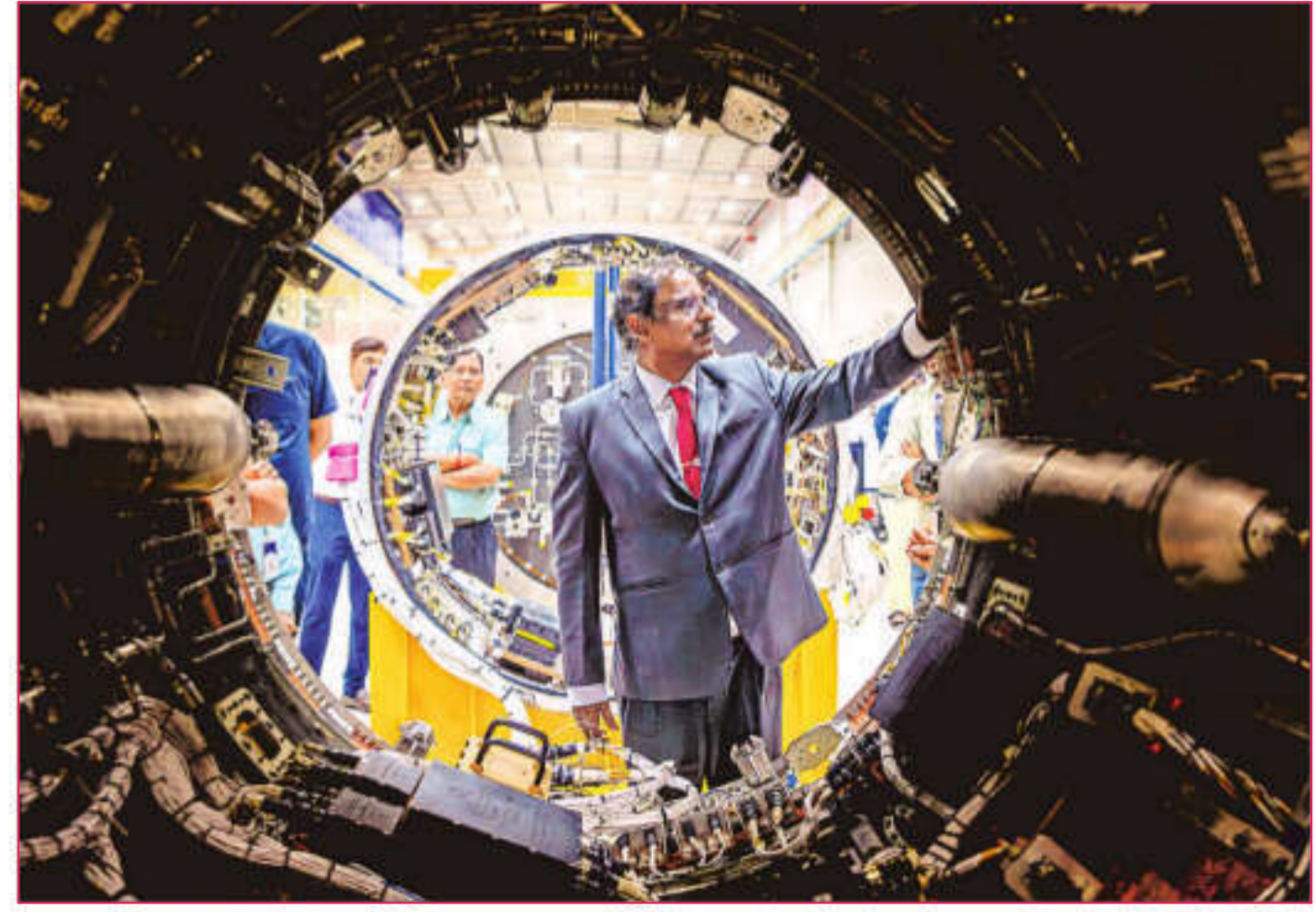
Isro Chairman V Narayanan during a visit to Skyroot Aerospace's MAX-Q and Infinity campuses in Hyderabad where he witnessed launch preparations for the Vikram-I rocket's upcoming maiden orbital flight