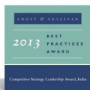
FROST & SULLIVAN Best Practices-2013