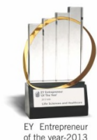
EY Entrepreneur of the year-2013