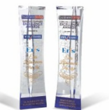
Business today/YES bank Excellence Awards-2013