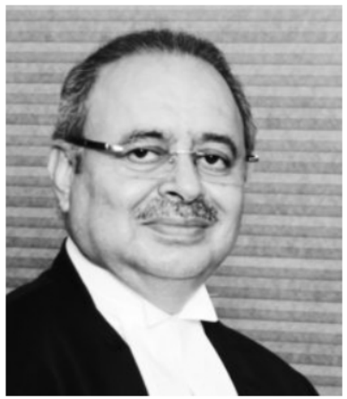
"ENOUGH PROCEDURAL SAFEGUARDS ARE PROPOSED TO PREVENT MISUSE OF SEDITION LAW"

In an exclusive interview, he told PTI that special laws such as the Unlawful Activities (Prevention) Act and the National Security Act operate in different fields and do not cover the offence of sedition and therefore, the specific law on sedition needed to be there too. Justice Awasthi asserted that while considering the usage of the law on sedition the panel found that "the present situation right from Kashmir to Kerala and Punjab to the northeast is such that the law on sedition is necessary to safeguard the unity and