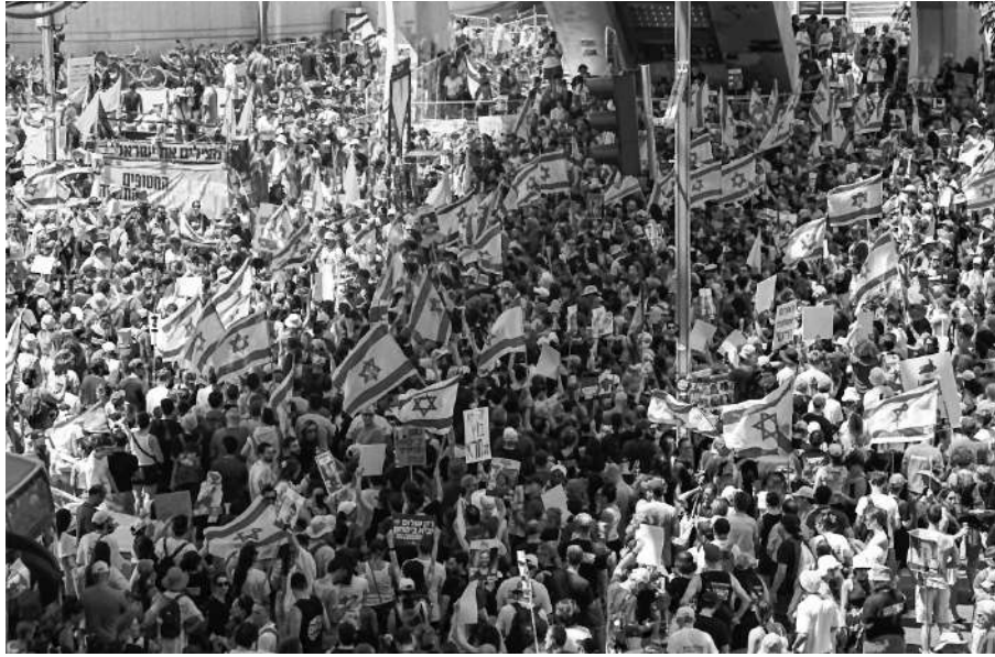
Families and supporters of Israeli hostages rally for their release in Tel Aviv

A call for a general strike in Israel to protest the failure to return hostages held in Gaza has led to closures and other disruptions around the country, including at its main international airport. But the call was being ignored in some areas on Monday, reflecting deep political divisions. Tens of thousands of Israelis poured into the streets late Sunday in grief and anger after six hostages were found dead in Gaza. The families and much of the public blamed Prime Minister Benjamin Netanyahu, saying they could have been returned alive in a deal with Hamas to end the nearly 11-month-old war.