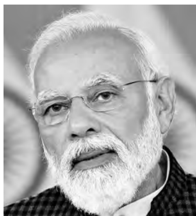
PRIME MINISTER NARENDRA MODI HAS OFTEN PUSHED FOR HOLDING ELECTIONS, FROM THAT OF LOK SABHA TO STATE ASSEMBLIES AND LOCAL BODIES, SIMULTANEOUSLY, SAYING FREQUENT POLLS HAMPER DEVELOPMENT WORKS

PRESS TRUST OF INDIA New Delhi, 25 January