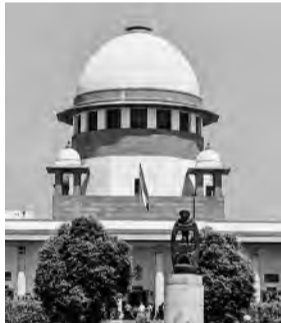
THE PLEA CLAIMS THAT PARTIES ANNOUNCE SUCH POPULIST MEASURES TO GAIN UNDUE POLITICAL FAVOUR FROM VOTERS

PRESS TRUST OF INDIA New Delhi, 25 January