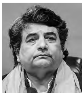
RPN Singh is the second big exit from the Congress in Uttar Pradesh after Jitin Prasad quit last year

Sabha elections only once from the Kushinagar seat in 2009, he has won the Pdrauna Assembly seat thrice — in 1996, 2002, and 2007.