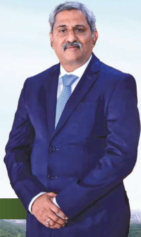
P.M. Prasad Chairman-cum-Managing Director

Stage-I Forestry clearances for 10 proposals of 1,432.82 Hectares and final approval (Stage-II FC) for 8 proposals for 1,948.22 Hectares were secured. CIL's subsidiaries have created a green canopy in and around the mining areas by planting 40.38 Lakh saplings over 1712.73 Ha. Additionally grassing has been carried over 206.80 Ha along with gap plantation of 1.56 Lakh saplings over 85.4