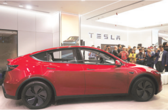
Tesla officially entered the Indian market on July 15 with the launch of its Model Y in Mumbai

American electric car maker Tesla on Friday said it would launch its first charging station in Mumbai next week. The company, which had announced its much-awaited entry into the Indian market last month, said the first Tesla charging station in India will feature four V4 supercharging stalls (DC charging) and four Destination charging stalls (AC charging). The Tesla supercharging stalls offer a peak charging speed of 250 Kw starting at ₹24/Kw and destination chargers providing 11Kw at ₹14/kW, it said in a statement. “This will be the first of the eight supercharging sites that were announced during the launch in Mumbai, with more planned across the country, to provide the optimal cross-country experience”, the com-