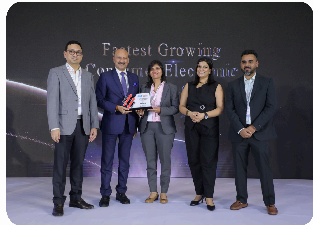
Fastest Growing Consumer Electronics Brand 2024