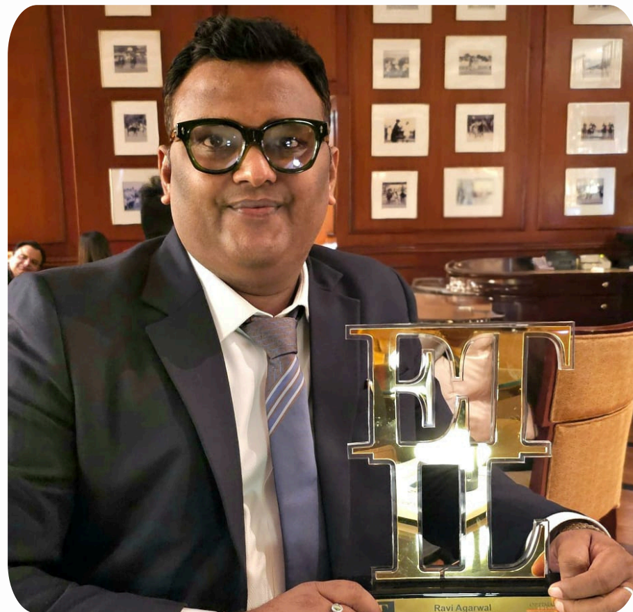
Fastest Growing Consumer Electronics Brand 2024

Cellecor Gadgets Limited, one of India's fastest-growing consumer electronics brands , continues its expansion with the launch of its first exclusive store in Bihar, located in Sasaram . This milestone strengthens Cellecor's commitment to making advanced technology more accessible to consumers across the country.