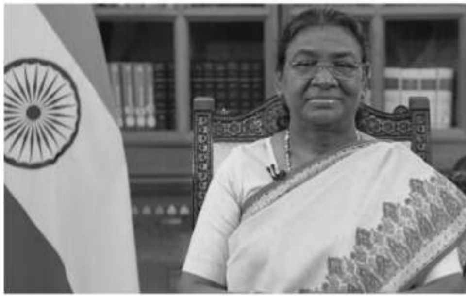
In her reference to the SC, President Murmu sought to know: "Is the exercise of constitutional discretion by the President under Article 201 of the Constitution of India justiciable?"

Under Article 145 (3), when the President makes a reference for the court's opinion, it is placed before a five-judge bench. In the Ayodhya dispute, the apex court, citing pendency of the case, had declined to