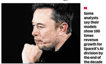
Some analysts say their models show 100 times revenue growth for SpaceX's AI division by the end of the decade.