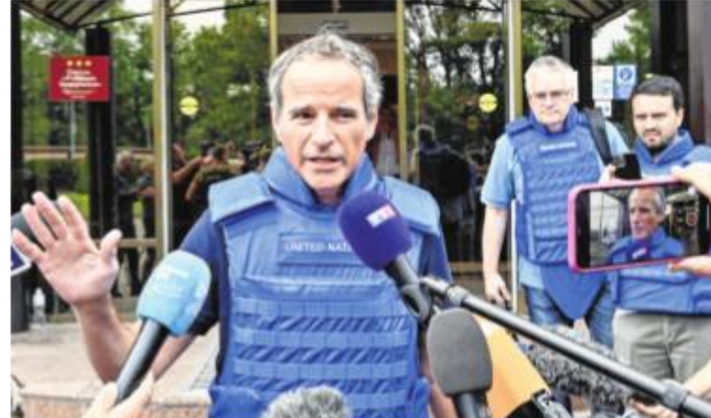
IAEA chief Rafael Grossi speaks to media in Zaporizhzhia on Thursday

The company said earlier on Thursday that Russian mortar shelling had led to the shutdown of one of its reactors by its emergency protection system and had