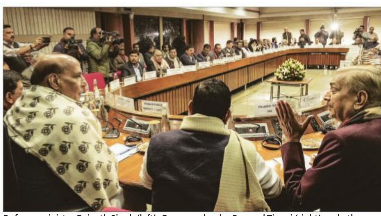
Defence minister Rajnath Singh (left), Congress leader Pramod Tiwari (right) and others during the all-party meeting, in New Delhi on Tuesday

EXPRESS NEWS SERVICE New Delhi, January 30