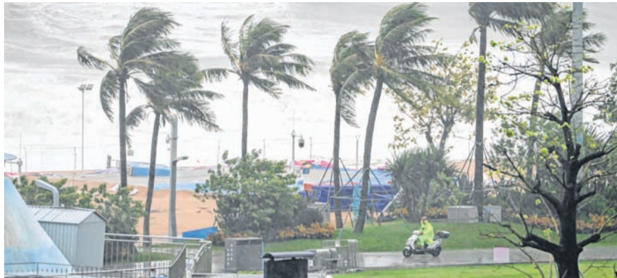
A security man patrols along a beach, as Typhoon Ragasa moves near Shenzhen in Guangdong.

Described as the most powerful storm to hit the Chinese coast this year, Ragasa, the 18th typhoon of the season, is forecast to make landfall along the coastline of Guangdong province, official media in Beijing reported. It could become